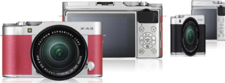
FUJIFILM X-A3 and X-A10