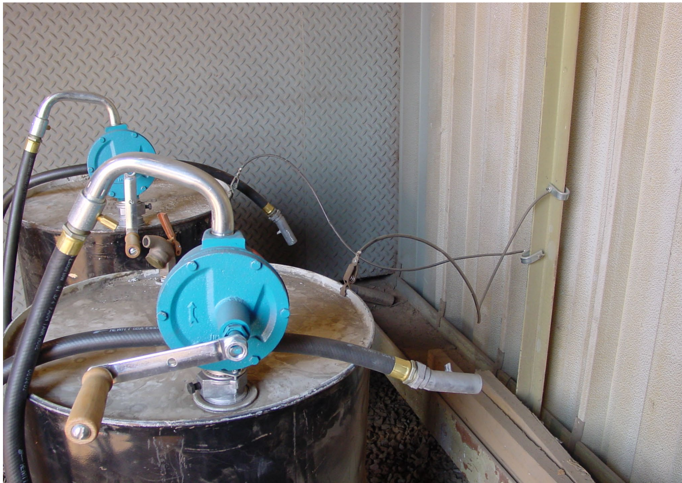
Paint Mixing Area