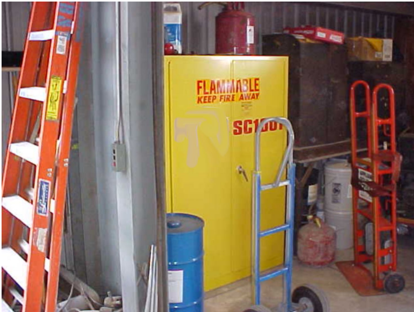
Paint Storage Cabinet Area