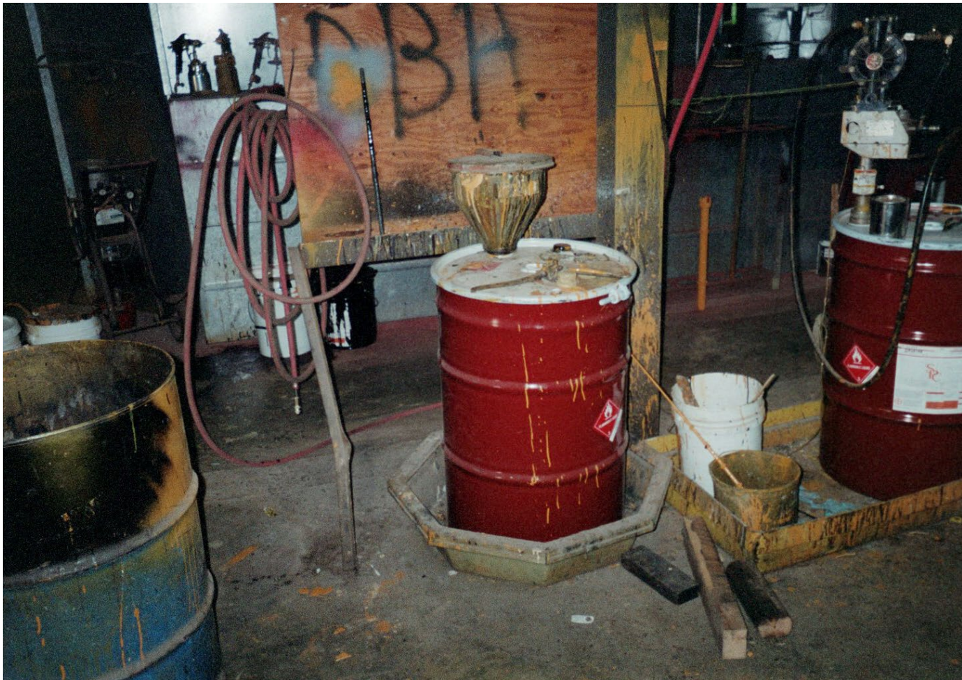
Paint Mixing Area