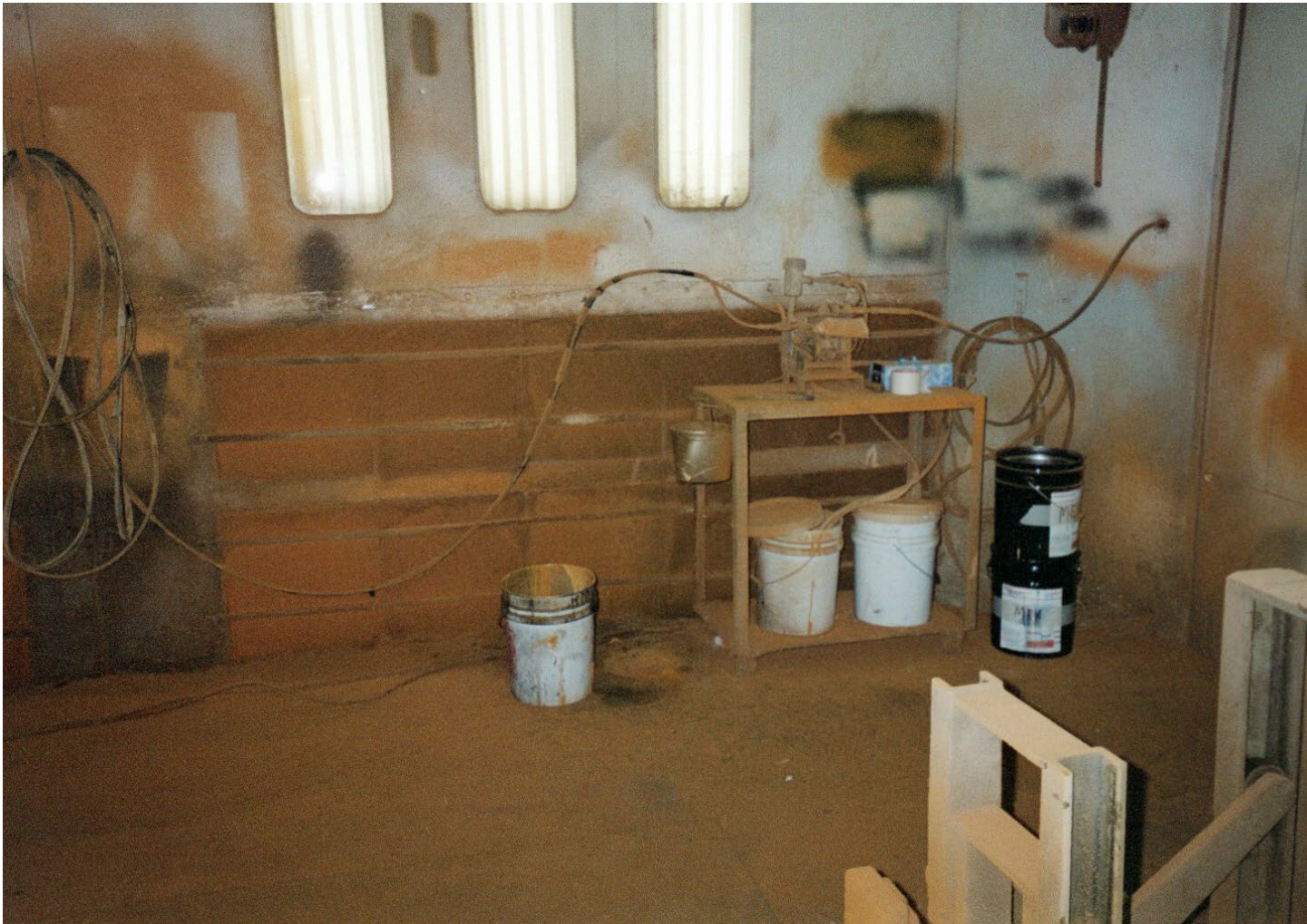
Paint Spray Area