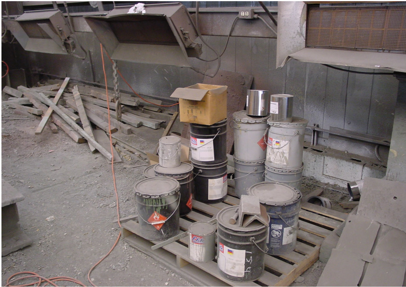
Paint Storage Area and Overflow Painting Area