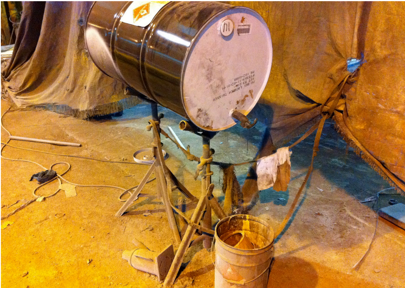
Paint Thinner Storage in Paint Spray Area