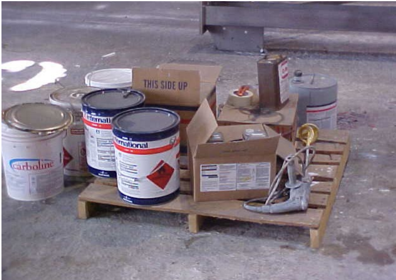
Paint & Thinner Storage in Paint Spray Booth